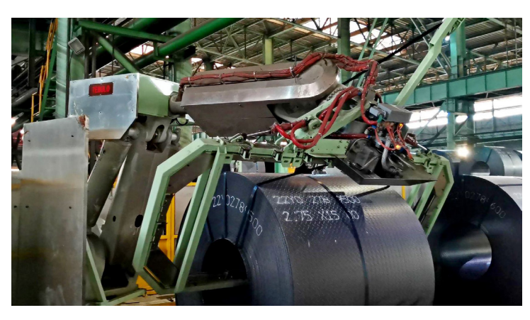
Multiple strap positions