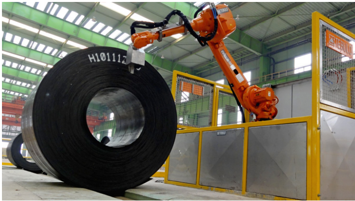
Cold coil flat face marking