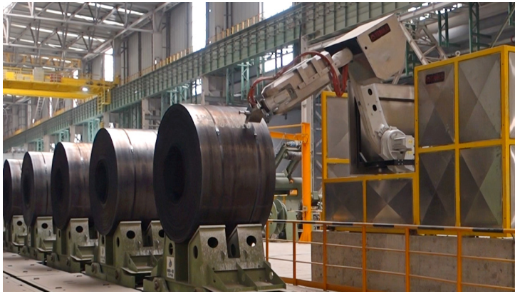
Hot coil circumference marking