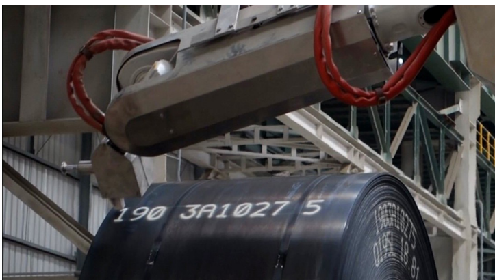
Single nozzle marking head