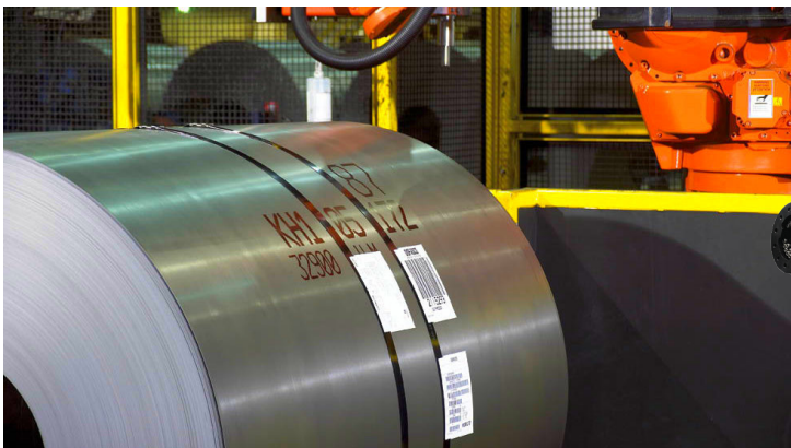
Marking & labelling