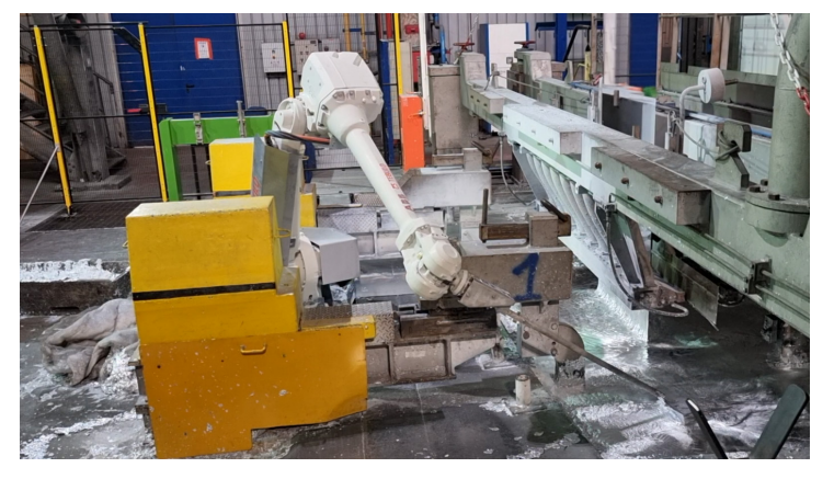
Front side robot on fixed base