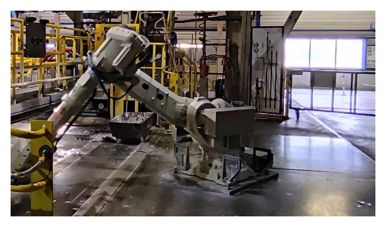
Front side robot with removal base